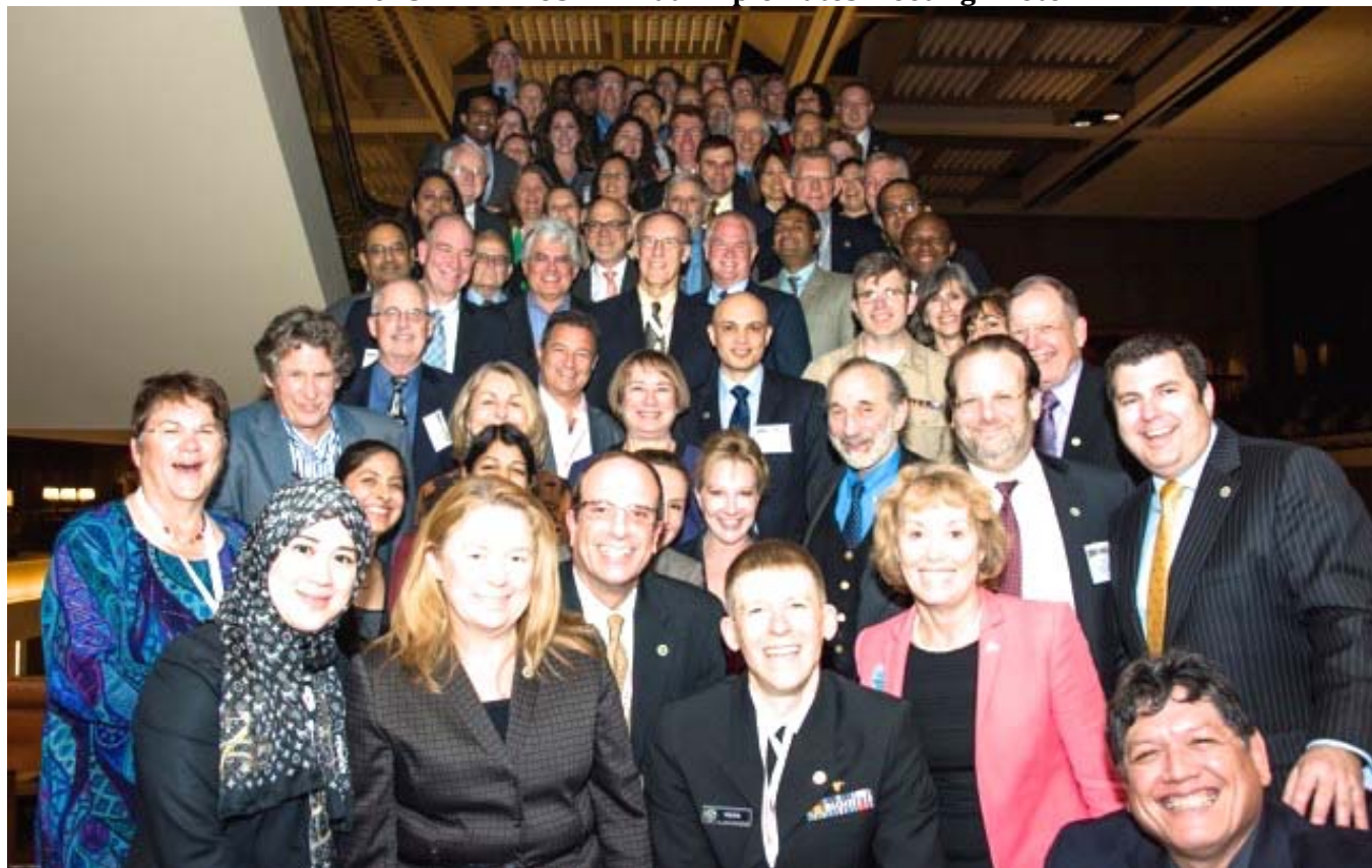
75 members and guests attended the 2015 ABDPH 65 th Annual Diplomates Meeting and Banquet on April 27 th , 2015 at the Sheraton Crown Center in Kansas City, MO. Selfie